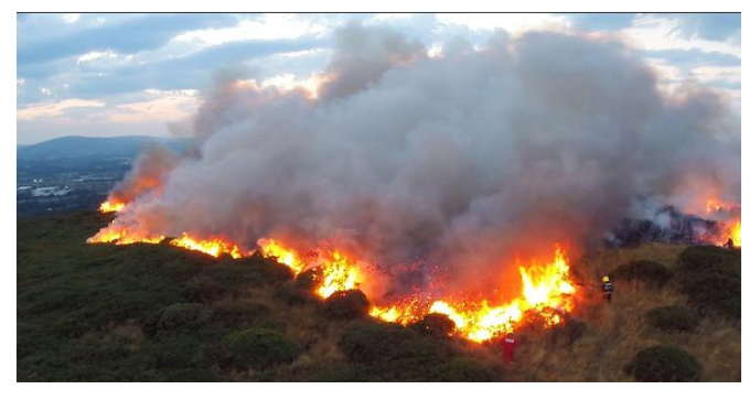
Bray Head Special Area of Conservation fire, 2018

As well as rivers and lakes Wicklow's water systems contain such features as ponds,