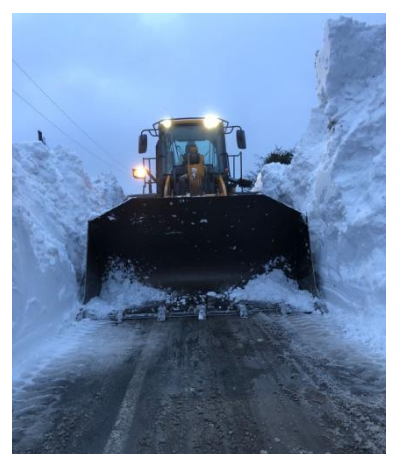
Snow Plough Storm Emma 2018

dealing with the impacts. All known impacts from small to large were recorded.