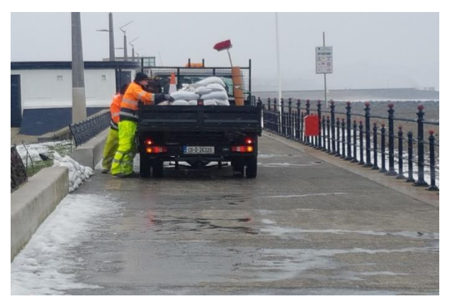
Sandbagging in preparation for a storm surge on Bray Promenade \,

While this strategy is focused on adaptation Wicklow County Council notes its commitment in Chapter 1 to energy reduction targets under the Public Sector Energy Efficiency Strategy and those contained in the new