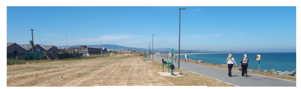
The Murrough, Wicklow, Summer 2018

The coastal zone in County Wicklow stretches the length of the county over 60 kms. The coastline of Wicklow varies greatly in appearance and in physical composition as one travels from north to south. The northern end of the coast is dominated by the rocky outcrop of Bray Head and the sea cliffs between the towns of Bray and