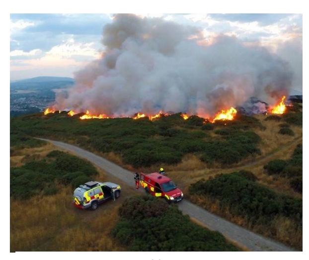
Fire Services at scene of fire on Bray Head 2018

Type of event: The summer of 2018 was notable for warmer than average temperatures, close to records achieved in 1976, and lower than average rainfall with less than a third of normal amounts. After a very cold spell in March temperatures were above average in April and May before becoming very warm through June, July and into August. A heat wave was declared on the 22nd of June with temperatures above 30.C. On the 5th of July an absolute drought was declared leading to a nationwide hosepipe ban. Rainfall, when it did come later in July and August, was more notable in the northwest of the country with low rainfall levels persisting in the south east. The hose pipe ban was kept in situ for the Greater Dublin region until September. Lower than