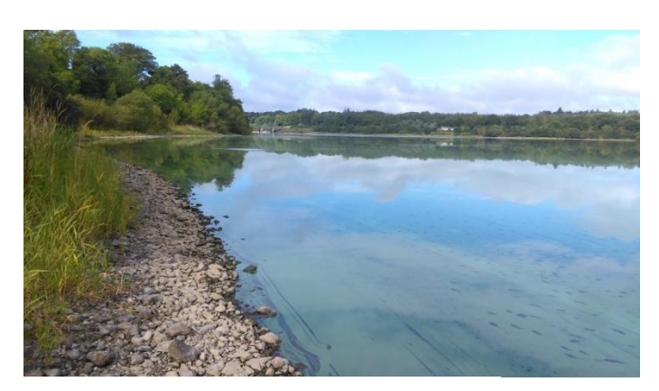
Low water levels in Vartry reservoir and algal bloom in Blessington lakes, 2018

average rainfall and then a heat wave created a significant fire risk. A red warning was issued by the Department of Agriculture for forest fires nationwide. On a more positive note it also created more demand for rural and coastal tourism and recreation.