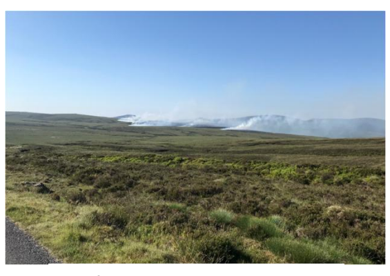
Bog fires in Wicklow Uplands 2018

The Wicklow Mountains are the source of many river systems some of which are large and of regional importance. The River Liffey, rises in the county, and is a major source of water for Greater Dublin. The River Dargle runs to the Irish Sea at Bray. The Avoca River forms from the confluence of the Avonmore and Avonbeg and is joined by the Aughrim river before discharging at Arklow. The River Slaney drains a significant part of the west and southwest of the county. One of the smaller rivers of the county, the River Vartry is also important to Dublin's water supply. East Wicklow has a number of smaller rivers that drain directly from the uplands to the Irish Sea.