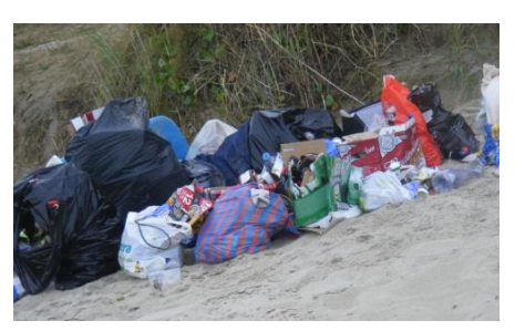
Litter collected on Brittas Bay Beach following a busy day with visitors during Summer 2018.

The good weather brought increased visitor numbers, which proved a welcome boost for many local businesses. Key sites however were often challenged in the management of parking and litter control, including beaches, the Blessington lakes, Glendalough and the uplands. Brittas Bay was busy and as parking filled local properties provided an alternative with parking on the road causing congestion. Litter management was also a concern on the Blue Flag beaches of Brittas Bay. The skips at Brittas Bay required emptying every second day at the peak of the heat wave. Litter left on the beach became a daily problem. Local volunteers with Coast care played a role in cleaning the beach daily.