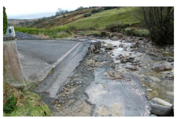
Road washed away by fluvial flooding, before and after

Cost of event: In the UK and Ireland Barney is estimated to have cost €198 million, Desmond €970 million, Eva €2.2 billion and Frank €310 million. The highest costs occurred as flood levels reached their peak in late December following Storm Eva. Wicklow County Council had a certified expenditure of €2,418,968 for storm damages that could not be met from existing approved resources. The range of damage done to infrastructure was large covering most services in the organisation. Key costs included the repair to Wicklow Town Swimming Pool, €190,000, the damage done to the weir in Ashford, Brittas Bay and the Murrough estimated to cost €954,680, replacement of a bridge paraphet €95,000, extensive repairs required on drains and culverts, carparks, road edges, etc. in five municipal districts €1,355,000, repair of council house roofs €38,000, retained fire crews €24,388, damage to Wicklow library €1,000.