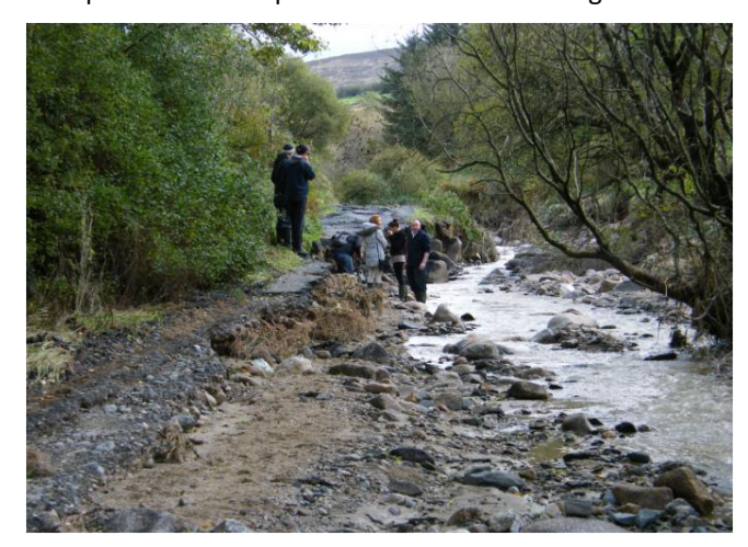
Road washed away in fluvial flooding.

is having and will continue to have on the County of Wicklow and its citizens. It addresses how Wicklow County as an organisation responds to the impacts of Climate Change. It does not look directly at the work being done to prevent or mitigate Climate Change. It is a part of the combined effort we must make on Climate Action to both prevent it happening and also prepare for how it will impact on us in the coming years. To date, the focus when addressing Climate Change has been almost entirely on mitigation through reducing our carbon emissions. It is now timely that through this strategy we also plan for the impacts it will bring to Wicklow.