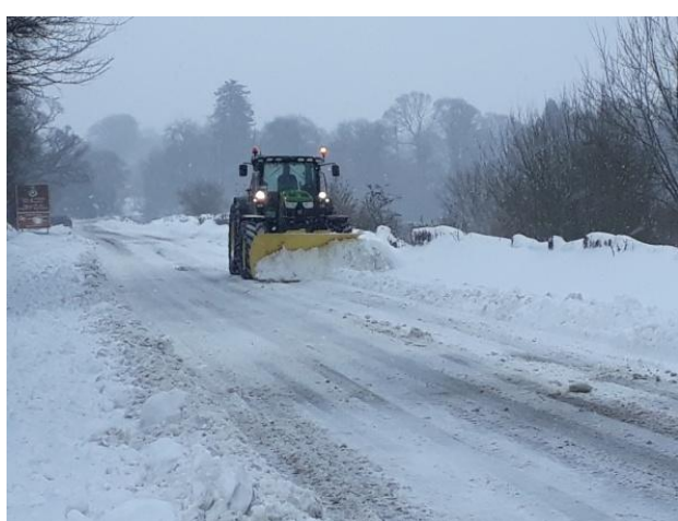
Clearing the roads during Storm Emma.