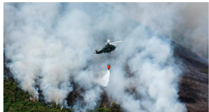
Air Corp Fire Fighting, Bray Head SAC, 2018

The Wicklow Mountains National Park was established in 1991 to conserve the local biodiversity and landscape. The dominant habitat of the uplands consists of blanket bog, heath and upland grassland. Mountain blanket bog is found in areas above 200 metres (660 feet) in altitude and where there are more than 175 days rainfall a year. Due to drainage of water from the bogs as a result of human activity, most of Wicklow's peat has dried out too much for Sphagnum mosses to grow and moorland and heath vegetation has taken