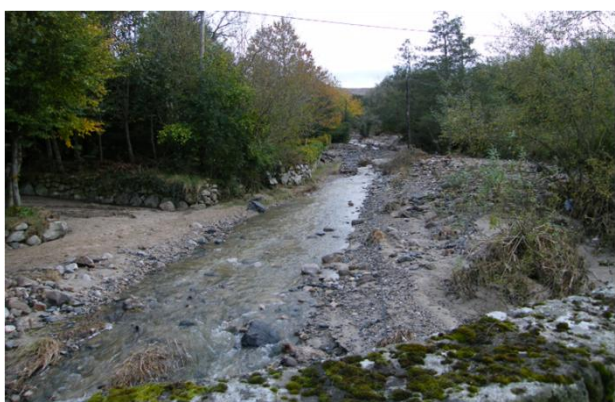
Road lost due to fluvial flooding. Before and after event.