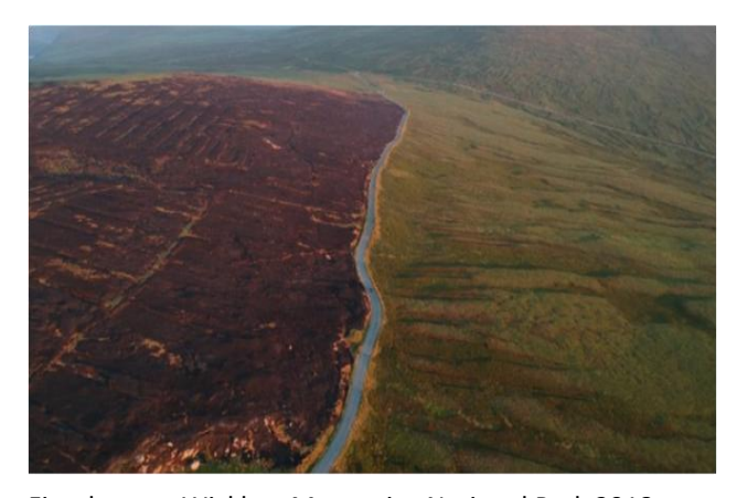
Fire damage Wicklow Mountains National Park 2018

aquifers, bogs, springs, coastal waters, wetlands some of which are recognised as being of local, national and EU importance, and many are designated for preservation under national and/or EU legislation. The County Wicklow Wetlands Surveys provide information on the ecological status, of all known and potential freshwater wetlands in the County.