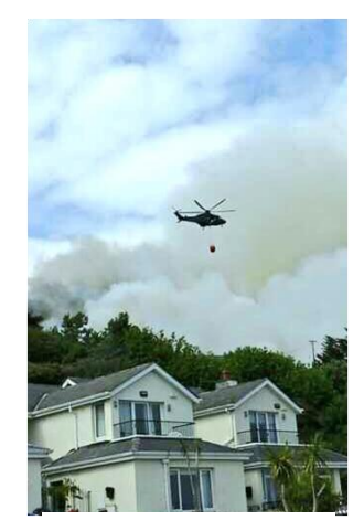
Protecting houses, Bray Head Fire, 2018

This trend continued through the summer and early autumn particularly in early July and it is estimated that the fires cost Wicklow County Council an additional €170,000 to operate Fire services above normal expenditure.