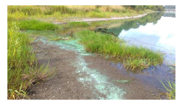
Algal bloom, Blessington lakes reservoir.

County Wicklow has ports in Wicklow and Arklow both under the ownership of Wicklow County Council and has harbours in Bray and Greystones. Both ports are well connected to the national road network via the M11.