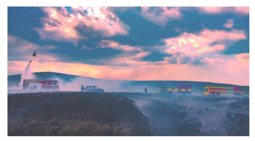
Fire Services and Air Corp fighting bog fires in the Wicklow Uplands

A fire on Bray head on the 14th of July was particularly significant. Several homes had to be evacuated. The Dart service had to be suspended for a day due to poor visibility. The Air Corps were called in and dumped 150,000 litres of water on the fire. The extent of the fire covered a large part of Bray Head and did significant damage to biodiversity in a Special Area of Conservation. Several homes were threatened by the fire and needed to be evacuated. In Kilmacanogue on June the 28th a school and housing estate were threatened by a gorse fire. The school and several houses were evacuated. On that day Fire services were also dealing with serious fires in Windgates, Greystones, Kippure, and Glencree. Gardai had to issue a warning about poor visibility in the Wicklow uplands on July the 2nd due to the large extent of fires.